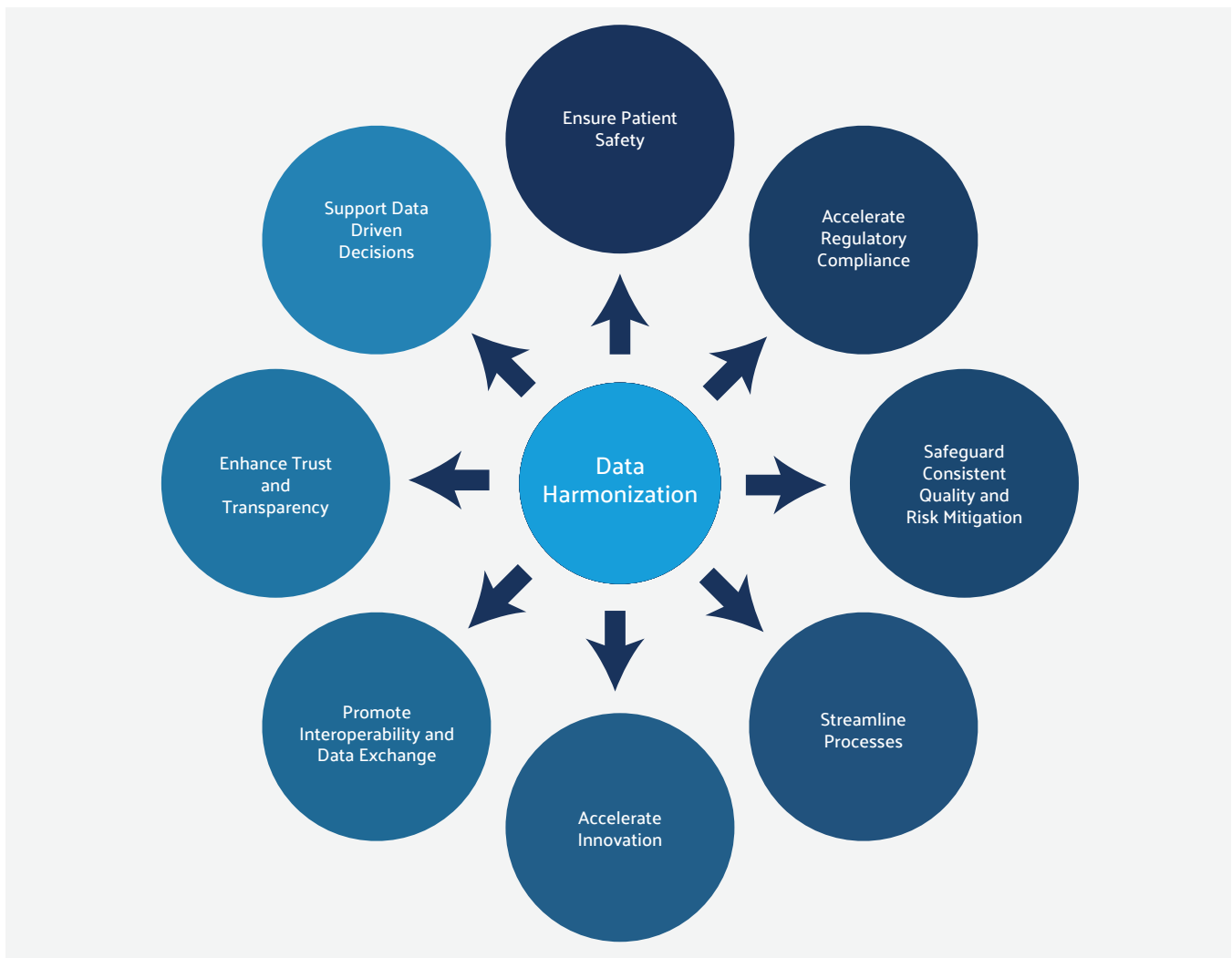
Figure 2: Data Harmonization Outcomes