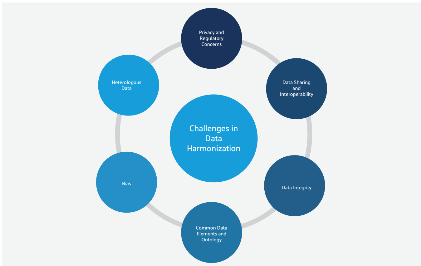
Figure 3: Adapted from Vasileios CP, Dimitrios IF. The pivotal role of data harmonization in revolutionizing global healthcare: A framework and a case study. Connected Health And Telemedicine . 2024;3(2):300004.

This collaboration has been highly productive and represents a step towards harmonized practices across the organization. It moves the needle beyond a save-and-store data mindset and establishes a dynamic sharing culture that leverages accessible data lakes, centralized repositories designed to store, process, and secure large amounts of structured or unstructured data.